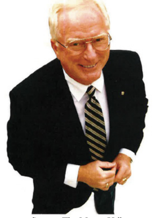
Serving The Miami Valley Since 1970