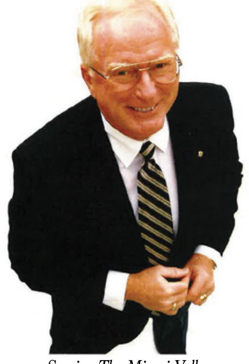
Serving The Miami Valley Since 1970