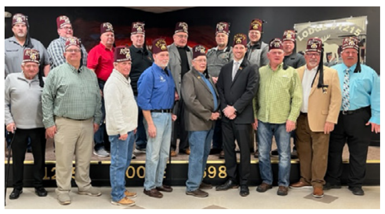
2023 Champaign County Shrine Club's Officers.