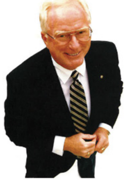
Serving The Miami Valley Since 1970