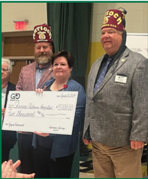
Greene Giving Shriners Hospital Donation