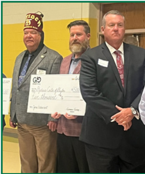
Greene Giving Dyslexia Center Donation