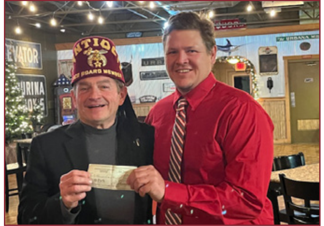
Champaign County Shrine Club Donation of $30,000.