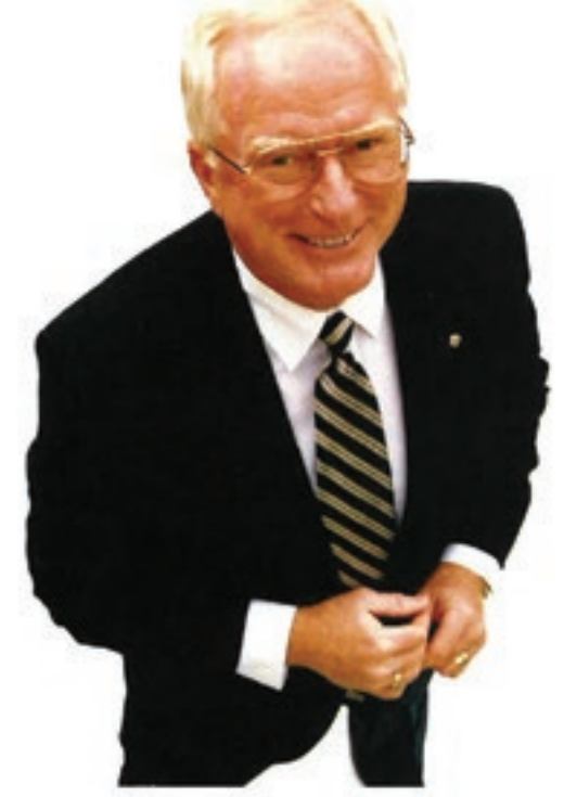
Serving The Miami Valley Since 1970