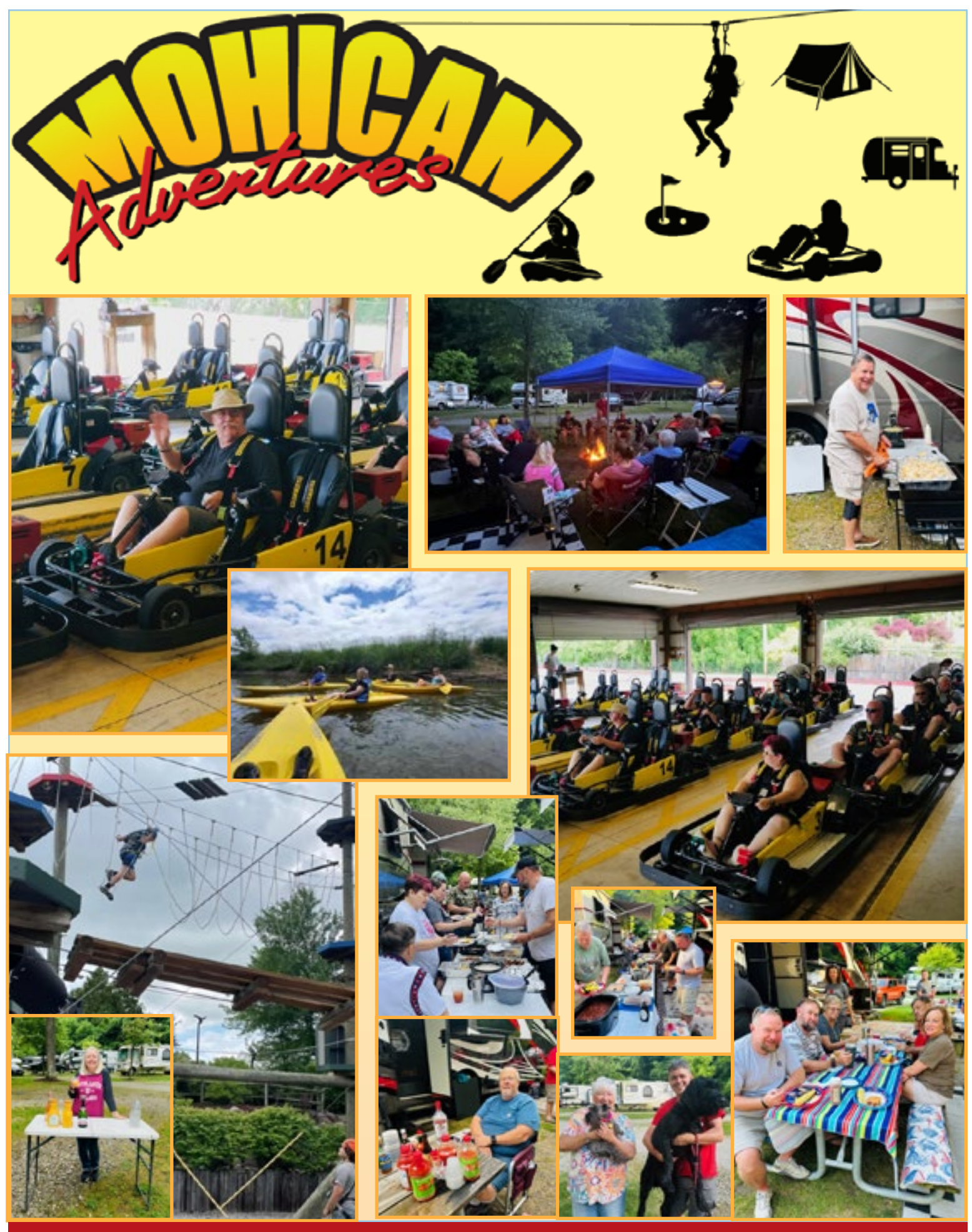
Page 7 ▲ A.C. – August 2023