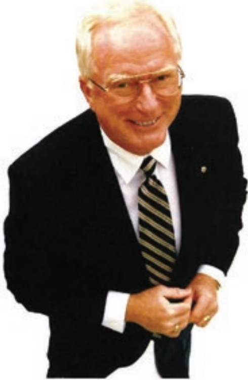
Serving The Miami Valley Since 1970