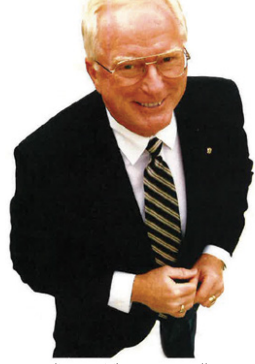
Serving The Miami Valley Since 1970